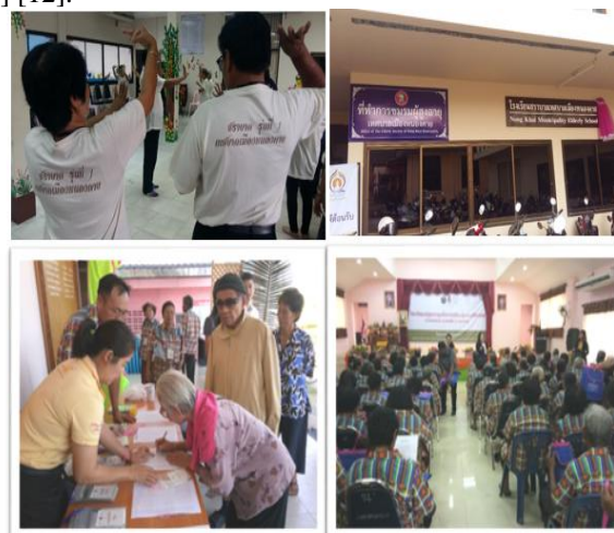
Fig. 2 Pictures of school activities for the elderly

3. To strengthen cooperation in health management and welfare of the elderly in the Northeast should get the cooperation of many units especially hospitals that promote health and communities jointly manage a model for the elderly. It is to have physical exercise activities and organize activities that promote income for the elderly sufficiency economy integrated farming collectively prepare in order to cause income and to exercise in the body or promoting merit-making. It will promote mental health and happiness, talked about Dharma to take care of the health from the mind as well as the consumption of food according to the principles of nutrition in the elderly holistic exercise. Therefore, the bond in the community age together is consistent with the research of Chanthana Mahamongkol (2004) [10] that found that the community bond of elderly people in Thamaka District Kanchanaburi. It is a factor that influences social activities of the elderly health awareness. It is a factor affect their participation in social activities of the elderly, indicating that when the elderly were perceived that their health is at the level of illness highly likely to have less participate in social activities. Likewise, when the elderly have perceptions of one's health as less illness or good health is more likely to have taken part in social activities [11] [12].